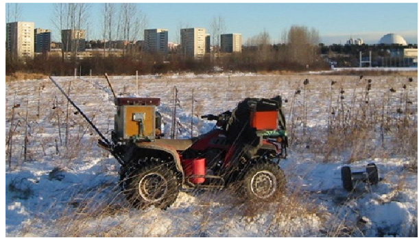
A Terraloc must be ready to operate wherever its operator wants to go

You can even connect an external display like an ordinary VGA compatible computer monitor or a projector directly to the Terraloc if needed.