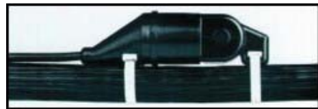
Geophones and hydrophones, Terraloc accepts input from all types of seismic sensors