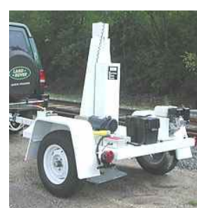
Terraloc accepts a wide range of trigger signals which allows the usage of a variety of energy sources.